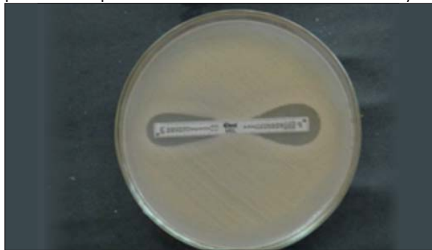
TABLE.1 Distribution of clinical samples and isolates

MBL Etest was performed according to the recommendations of the manufacturer(Biomerieux). Test organisms were inoculated on to plates with Mueller Hinton agar as recommended by the CLSI[13]. E test MBL strip(Biomerieux) containing a double sided seven dilution range of Imipenem (4 to 256 mcg/ml) and Imipenem (1 to 64 mcg/ml) in combination with a fixed concentration of EDTA was placed on the plate and incubated for 16 to 18 hours of incubation in air at 37°C. MIC ratio of Imipenem/Imipenem+EDTA of by \geq 8 , or reduction of Imipenem MIC by \geq 3 log 2 dilutions in the presence of EDTA or appearance of a phantom zone was interpreted as positive for MBL production[13,14]. The positive samples showed a MIC ratio of >8 in this study.